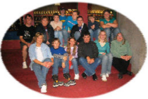
On November 12 th , the newly formed Pass It On parish youth group traveled to Spinnin' Wheels for an afternoon of skating.