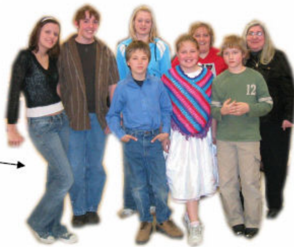
Pass It On joined the BUMC in their worship service at Westridge in Knoxville on December 10 th . The extra voices made the Christmas carols even more enjoyable.