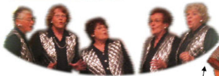
The first annual Lovilia Talent show was held on September 17 th at the LUMC. The Outreach Committee put on an ice cream social for all performers, their friends and family and guests. A perfect night of sweets both to the ear and the tastes.