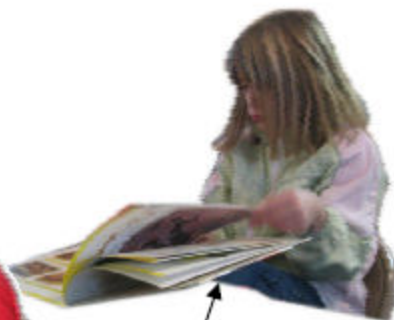
The last photos of the year were taken at the final meeting of Close Encounters on December 27 th from 9:00 AM-1:00 PM. At this four-hour finale, the students closed off their lessons on Creation, played many games, had a snack and lunch and made crafts which they took home with them. Close Encounters will resume their fun-filled adventures in February.

You can view all of our photos from 2006 on our newly designed website at lumc.webs.com