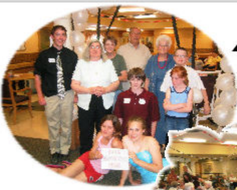
On June 3 rd , the Lovilia United Methodist Youth Group traveled to Westridge Nursing and Rehab Center in Knoxville and held the first annual Westridge Prom.