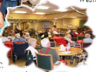
With snacks, crafts, interactive lessons, Games and songs, it couldn't have been any better.